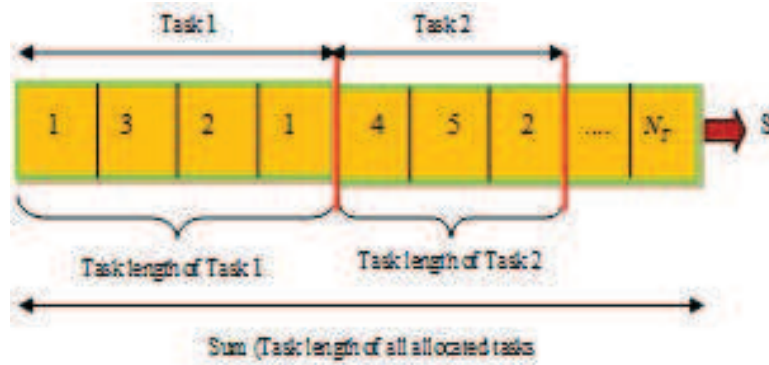
FIGURE 2. Solution encoding for Task Allocation

2. Solution Encoding: In the presented research model for optimal resource allocation, it is planned to optimize the virtual machines, such that the objectives (migration cost, utilization cost and make span) could be reduced. Fig 1 Portrait the natural architecture of task processed in cloud infrastructure whereas fig 2. Illustrate the applied solution encoding. In Fig. 2, 1, 3, 2 and 1 refers to the virtual machines that are mapped to task 1, similarly, 4, 5 and 2 refers to the virtual machines that are mapped to task 2.